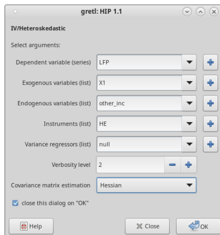
Figure 1: HIP GUI hook